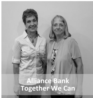
Alliance Bank Together We Can