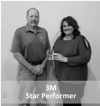
3M Star Performer

2017 Campaign Award Winners recognized at the 2018 Campaign Kick-off