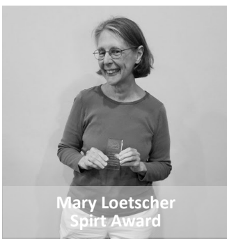
Mary Loetscher Spirt Award